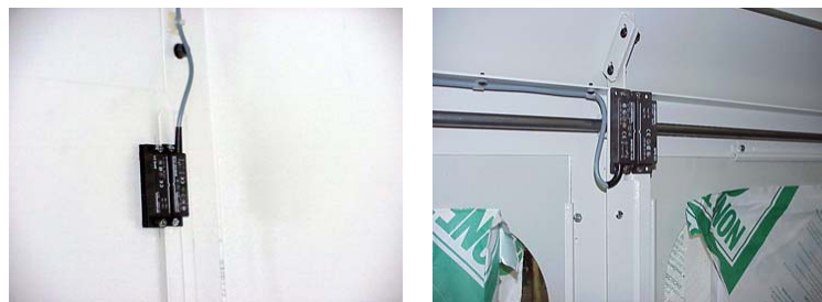
Figure 19-3 Coded Magnetic InterLocks

The chip auger wash system is activated and deactivated by the lower button on the control panel (labeled Start/Stop). The button is pushed once to activate the auger wash system and pushed again to deactivate the auger wash system. Either mode, Auger Wash or Wash Only, can be stopped immediately by opening the front doors or removing one of the side panels.