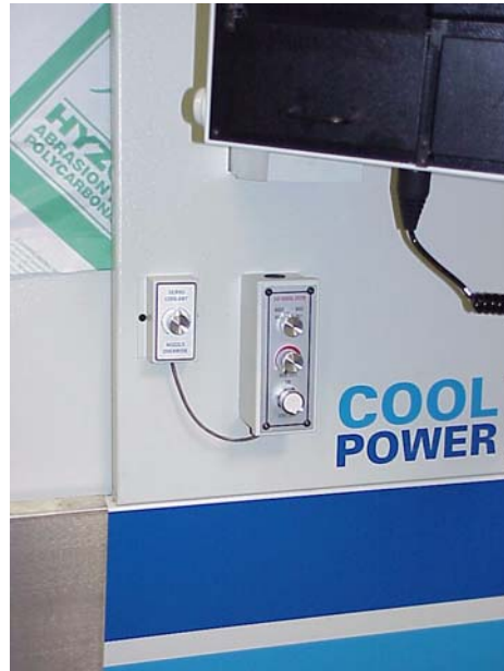
Figure 19-2 Control Box

their closed state (normal operation when the front doors are closed and the side panels are installed).