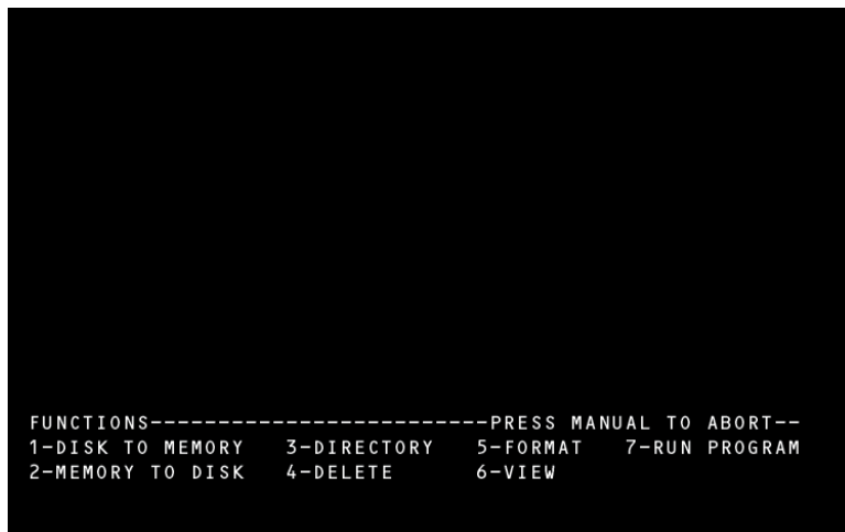
Figure 19-4 0-Disk Submenu

Access from Control The drive is accessed from the Functions menu on the CNC by selecting option 0-DISK. A submenu is displayed with the following options: